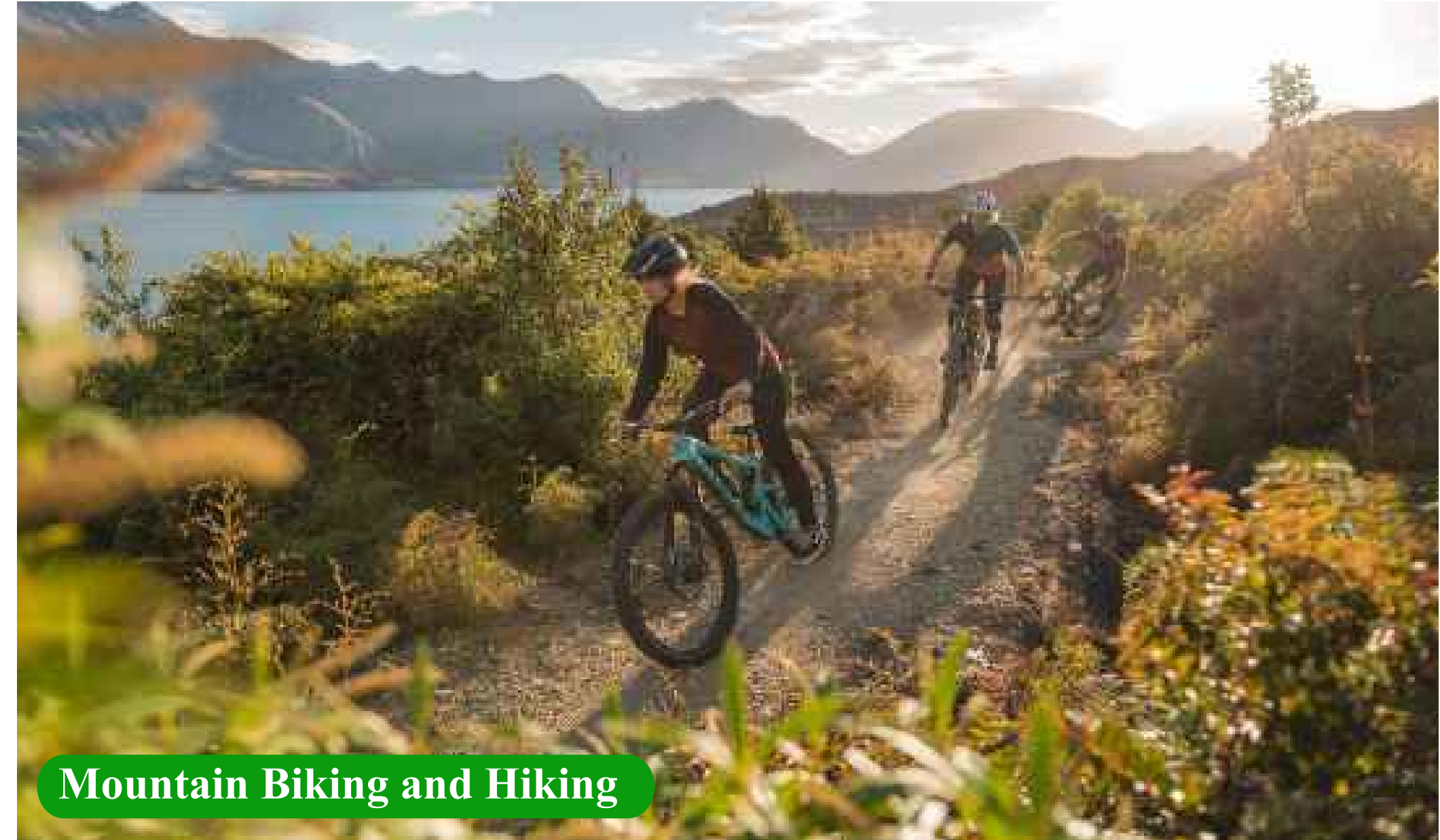
Mountain Biking and Hiking