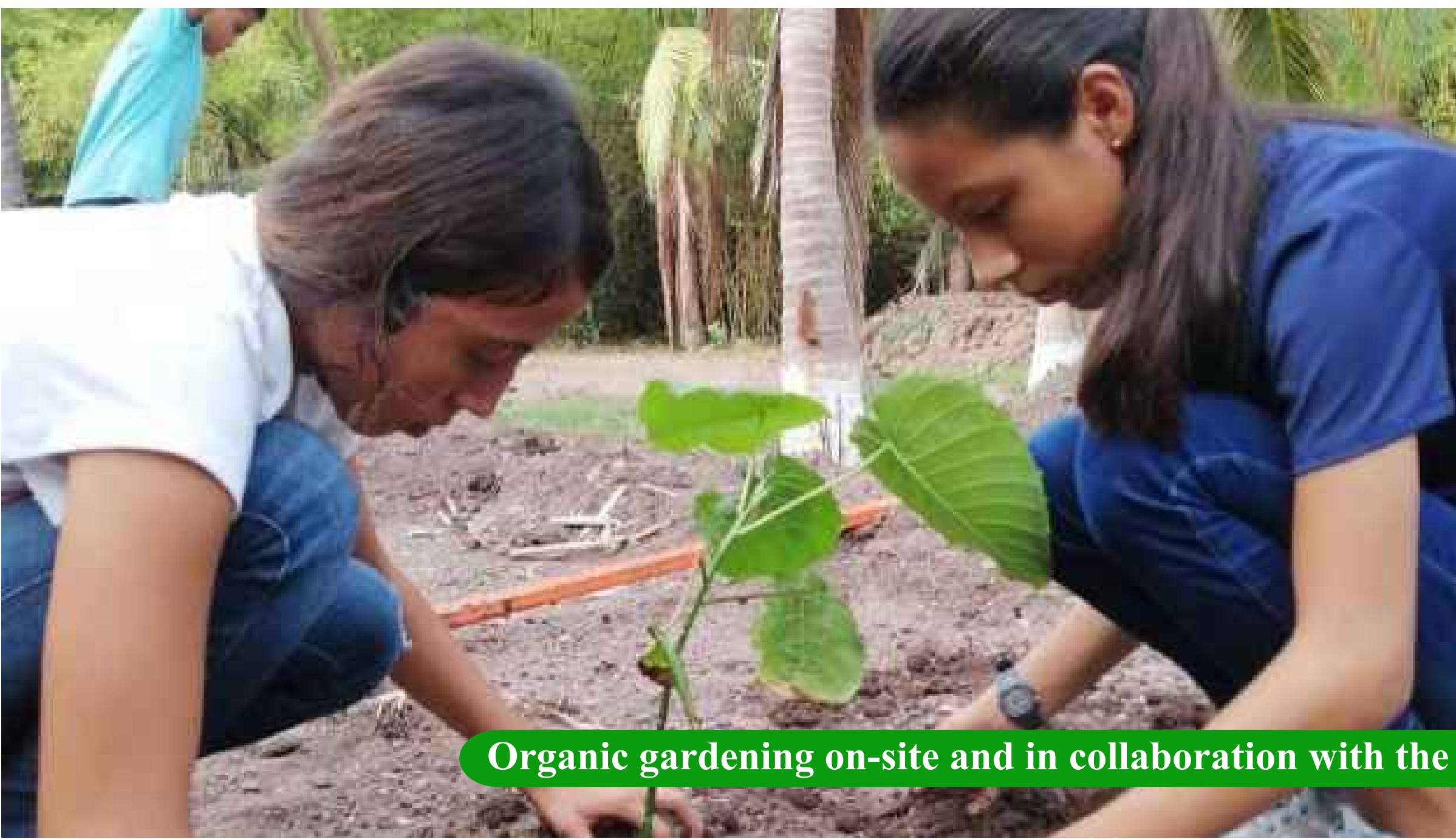
Organic gardening on-site and in collaboration with the Arroyo Seco Primary School Garden Initiative