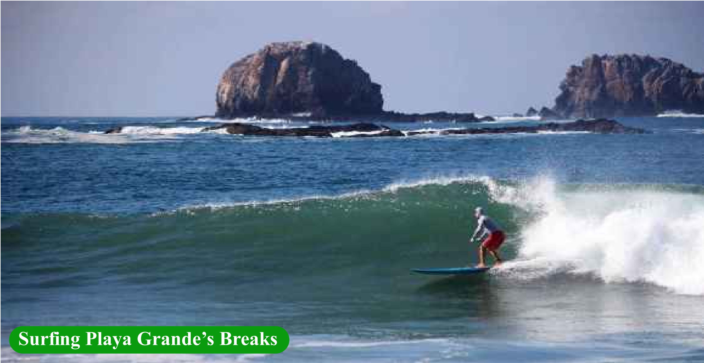
Surfing Playa Grande's Breaks