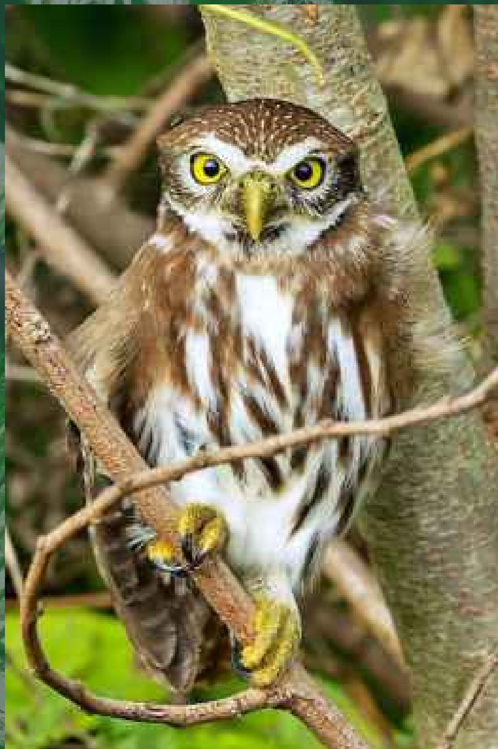
Ferruginous Pygmy Owl