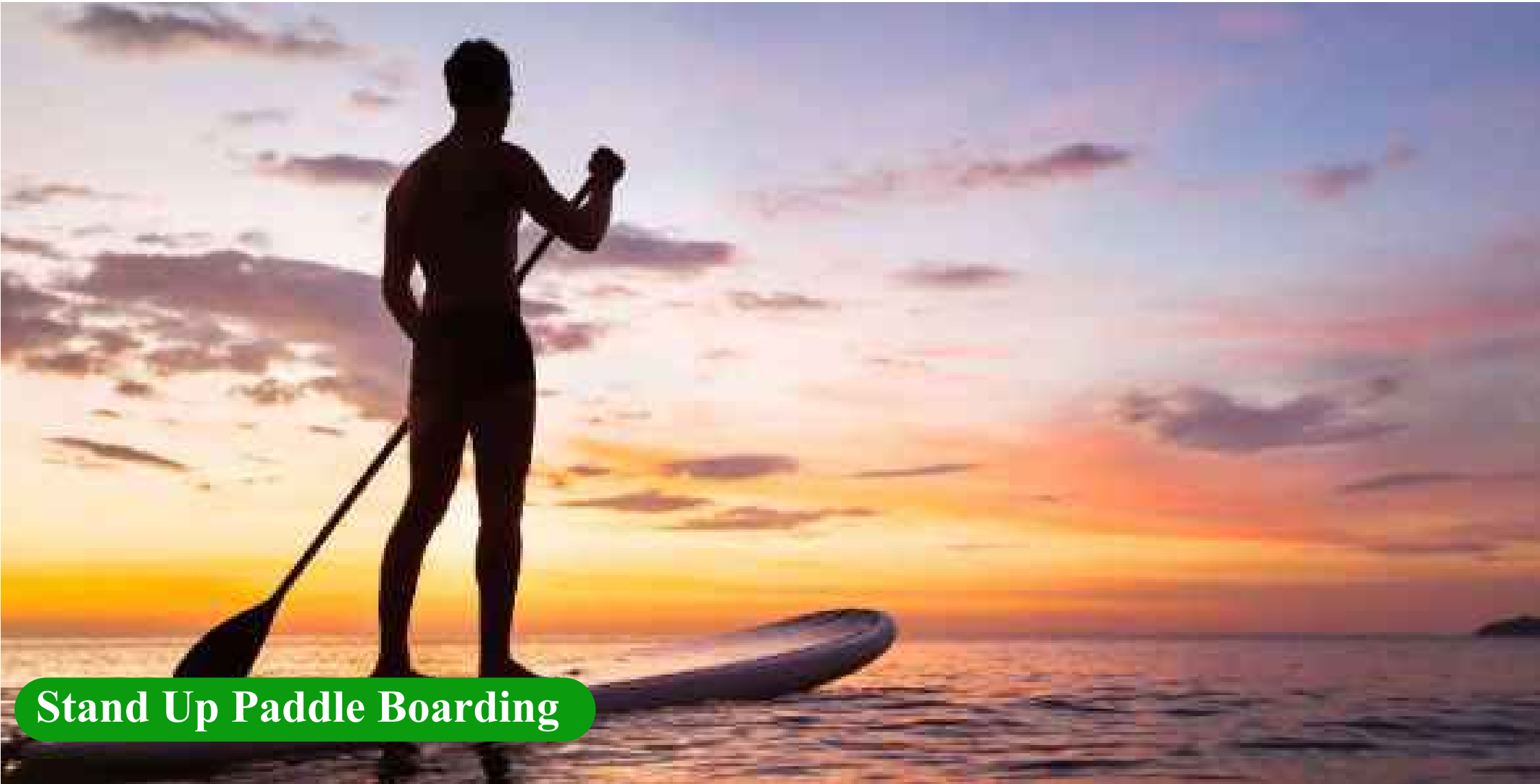
Stand Up Paddle Boarding